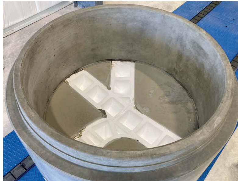
Efficient production of monolithic concrete manhole bases

ties, the manager responsible for meeting the planned production quantities can also control the production productivity for a longer period of time as a result. Manhole bases with a channel or berm, and blanks, are now manufactured at Foley in one procedure. Thanks to the Perfect planning software, neither complex channel formations nor different pipe connections in blanks pose a problem to plan their completion, since downstream work steps such as drilling connections or manual channel installation are no longer required.