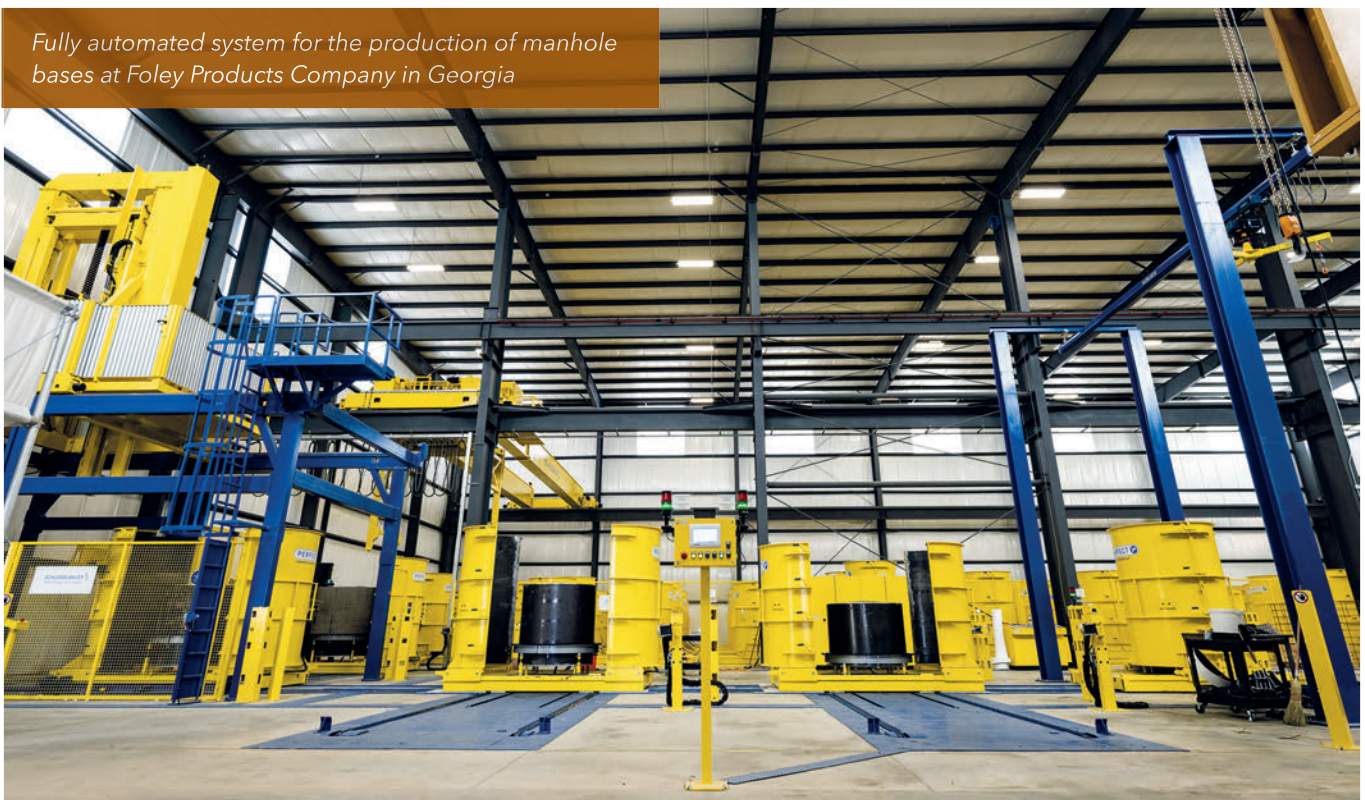
Fully automated system for the production of manhole bases at Foley Products Company in Georgia

As a successful company, Foley's owners and plant managers have always placed the highest capacity and product quality demands on their precast concrete products production systems. It's this attitude that brought Foley Products Com-