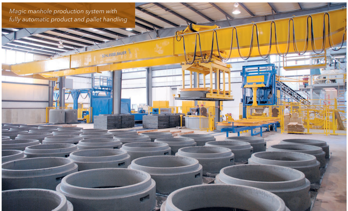
Magic manhole production system with fully automatic product and pallet handling

Products included in the production preview are reliably ready for delivery at the planned time and they are consistently made with high quality. Fluctuations in demand can of course also be used in the future to produce stock goods. However, demand-synchronized production in the Perfect manhole base system tends to reduce the quantity of precast parts produced in stock. This results in reduced capital costs with increased reliability of parts availability compared with the build-up of stock that historically occurred.