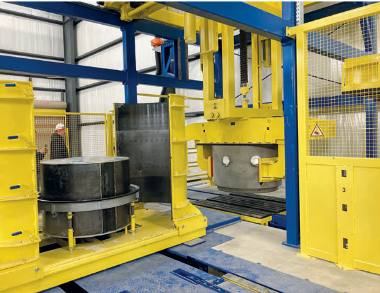
Automated manhole base demoulding with optimized cycle time

Next, openings are drilled at the relevant points for the subsequent pipe connections. Finally, if absolutely necessary, a channel is manufactured by hand to match the flow of the pipe connections, and it includes making a surface inside the manhole to stand on. This labor intensive process is normally conducted over several production days and it's very costly. In using this process, there is an extremely high probability of producing faulty parts or of making mistakes, due to the repetitive nature of the work and the physical strength it takes to carry it out.