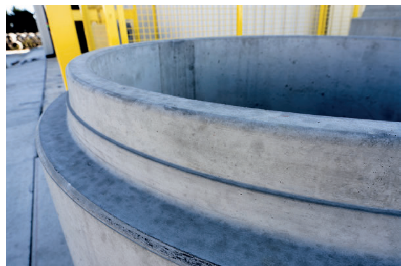
Outstanding component quality thanks to the use of self-compacting concrete