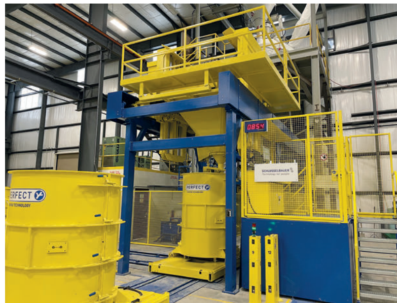
By setting up moulds based on the division of labor, moulds are constantly made available for filling with SCC.

The production of manhole bases with built-in channels is one of the most labor-intensive areas in precast plants. Traditionally, these components are frequently produced in two or three steps. In the first step, blanks are produced.