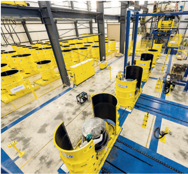
User-friendly moulds and scheduled processes—two cornerstones for efficient precast part manufacturing at Foley