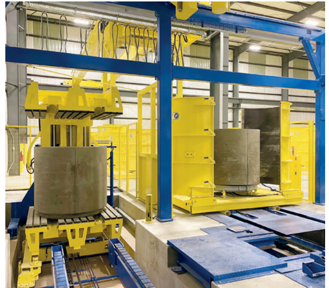
When required, demoulded products are automatically and carefully rotated by 180 degrees.

Through the installation of Schlüsselbauer's Perfect System, Foley has overcome the drawbacks and risks that conventional production poses. With Perfect, employees in the company's manhole base production are extensively supported by technology, and this support begins with the collection