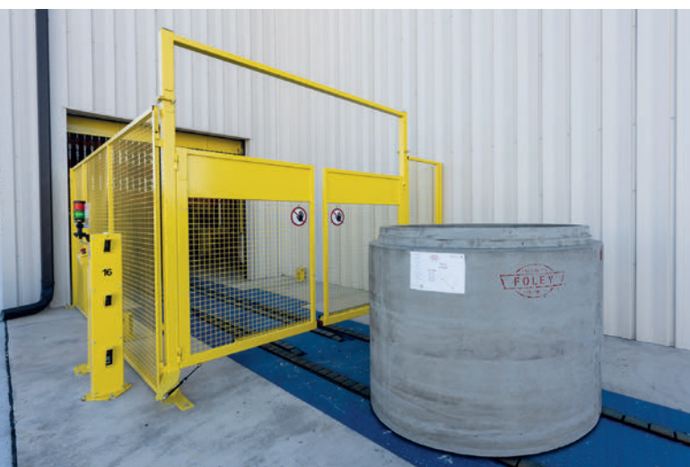
Manhole bases are transferred from the production hall with individual labels attached.

Scheduling the required work steps one manhole base at a time is not just advantageous, due to the clear responsibili-