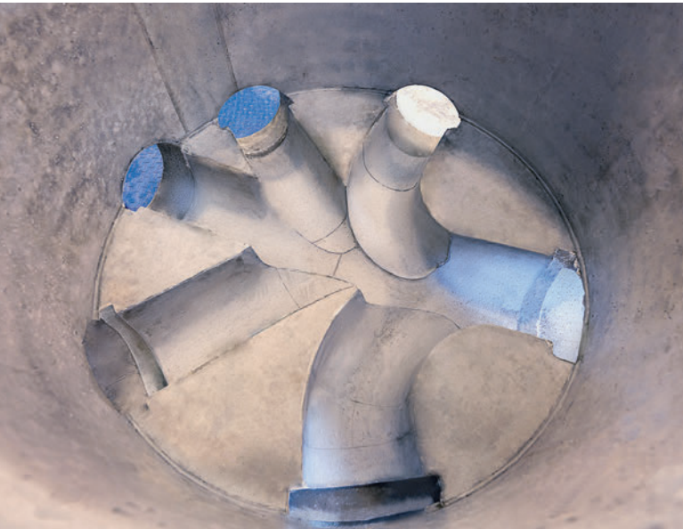
Precise production of manhole bases with channels and pipe connections